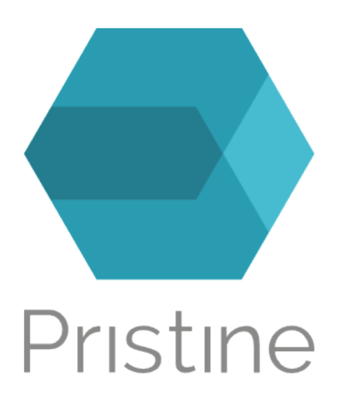
Figure 3. Official logo

The preferred logo only can be used over a white background. The logo should be surrounded by at least 25pt of white space around the image. This is not included in the default png images to allow for usage on web pages, where padding is also added by CSS.