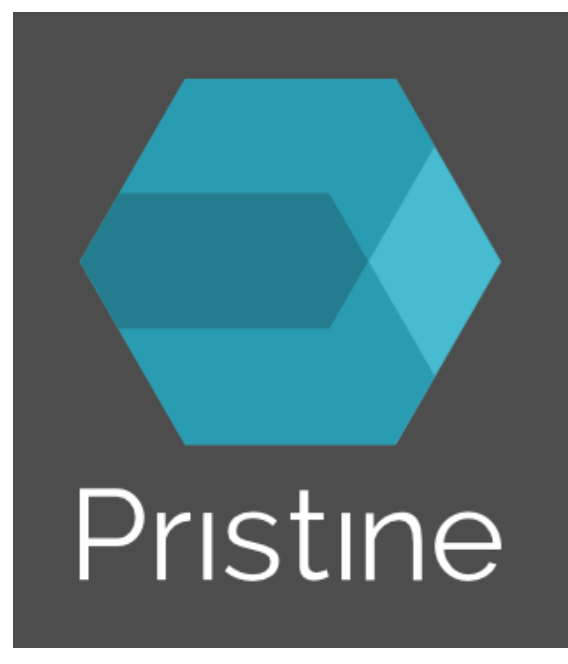
Figure 4. Alternate "dark" logo