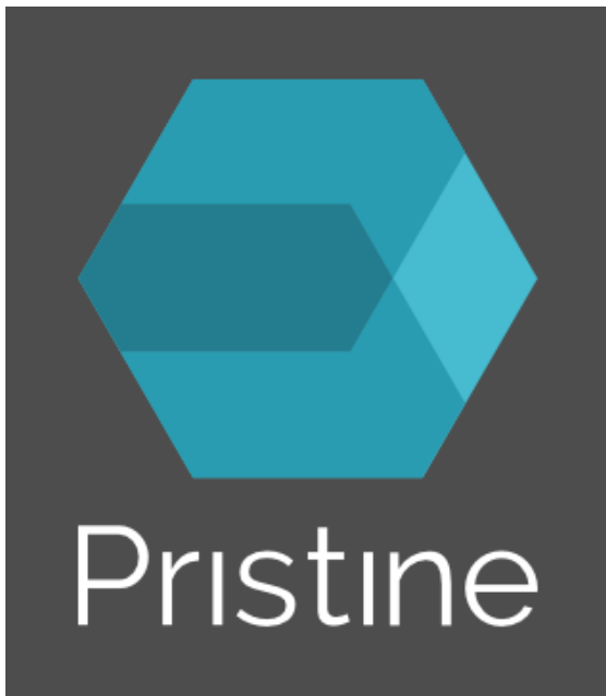
Figure 4. Alternate "dark" logo